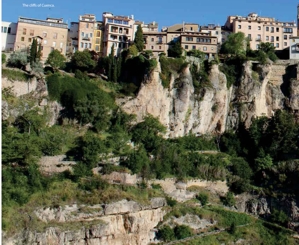
The cliffs of Cuenca.