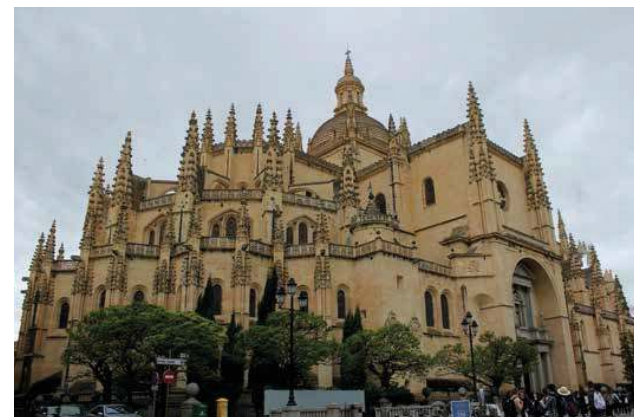
Gothic Cathedral, Segovia.

The Castles and Mountains Tour planners selected our route and overnight destinations with great care in order to obtain an ideal combination of great riding and wonderful sightseeing. Perfect roads and stops filled with the culture and rich history of Spain filled our days.