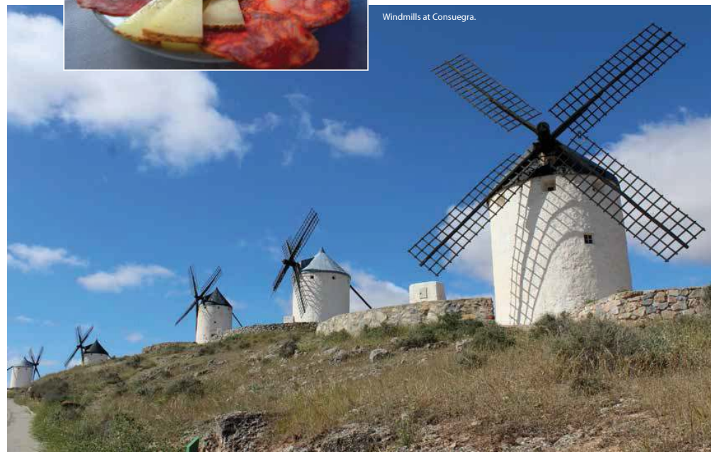
Windmills at Consuegra.

In Segovia we saw the famous aqueduct, one of the most impressive feats of Roman engineering. Its 166 stone arches—amazingly built without mortar or cement—tower over the city's Azoguejo Square. It has stood for over 2,000 years and is a true marvel to see. We spent several hours exploring the gothic cathedral and Alcazar Castle, built in the 11th century. Here is where we tasted our first Serrano ham, which comes from the black pigs we saw in fields along our route. It is carved directly from the cured leg, and if the hoof is not black, it is not authentic.