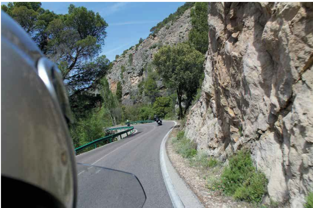
My view from the back seat.